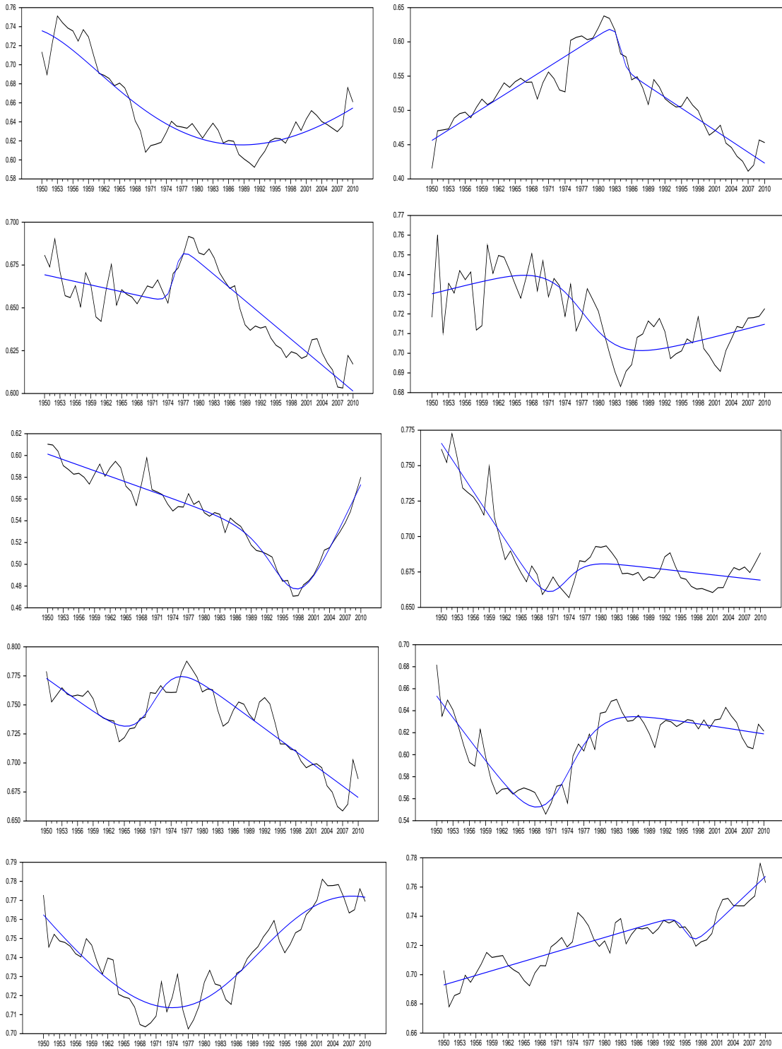
Figure 2: Consumption-income ratio (black line) and the fitted logistic smooth transition function (blue line) for Model C. The order of countries from left to right are Japan, Luxembourg, Netherlands, New Zealand, Norway, Spain, Sweden, Switzerland, the UK and the US.